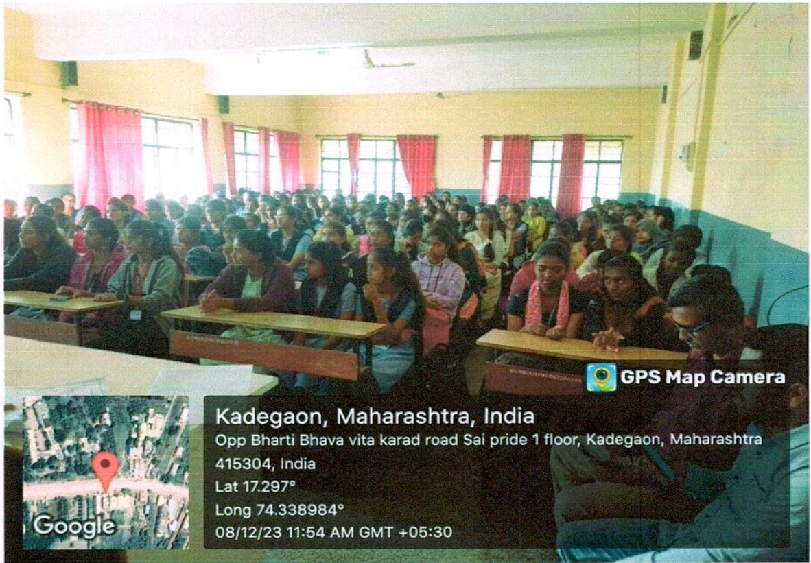
A large number of students attended the program