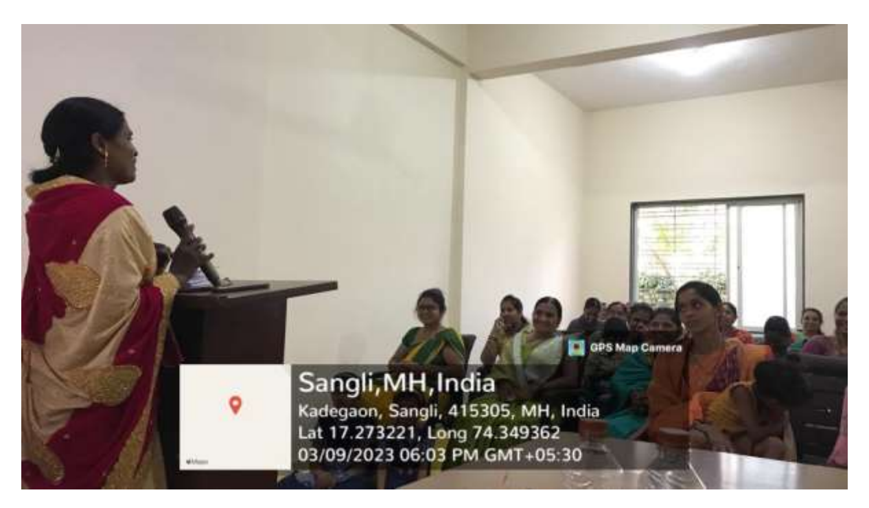
One Lady frankly Expressed her Opinion..