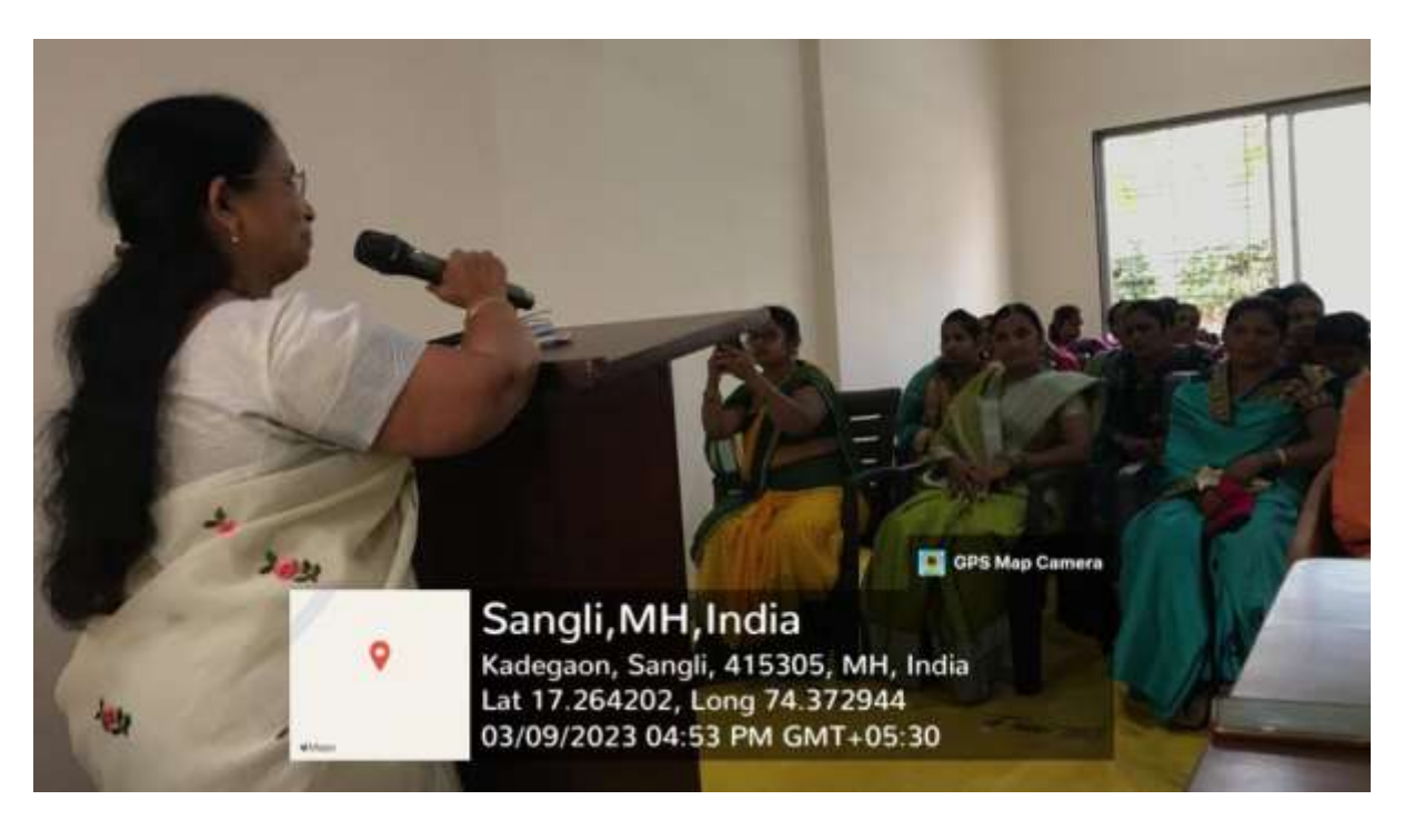
Given some examples like, Get together for Mahila Mandal, Yoga together, Self Help Group etc. and share their problems or some opinion to each other for self development.