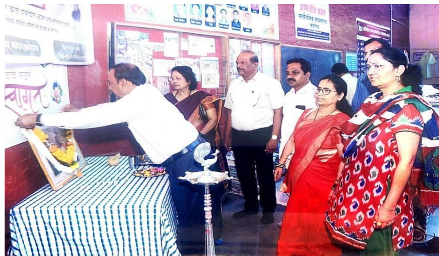
Idol Worshipping by offering garland of cotton fabric