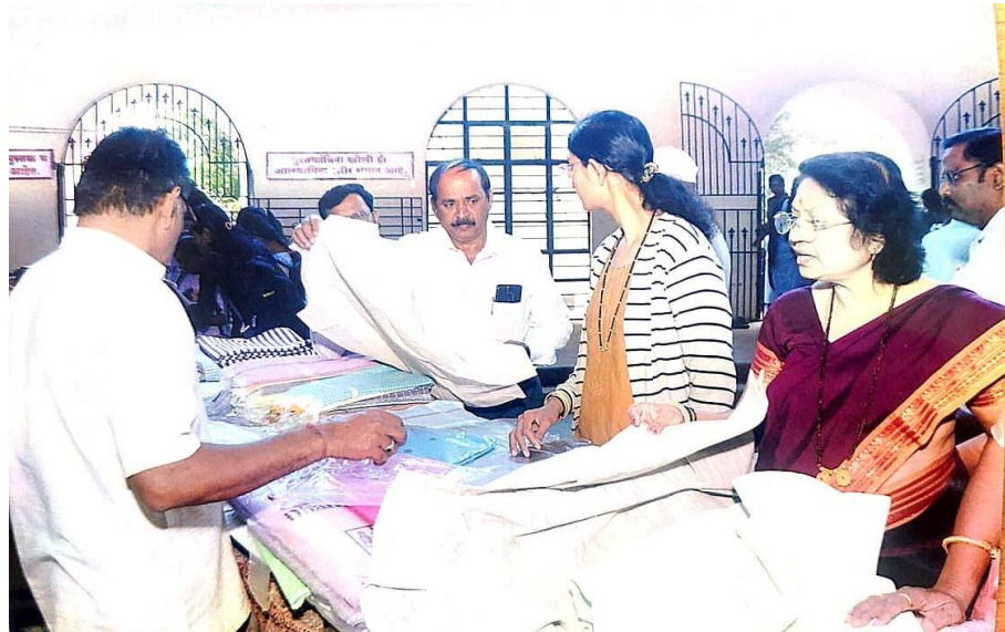
Khadi products for exhibition and sell