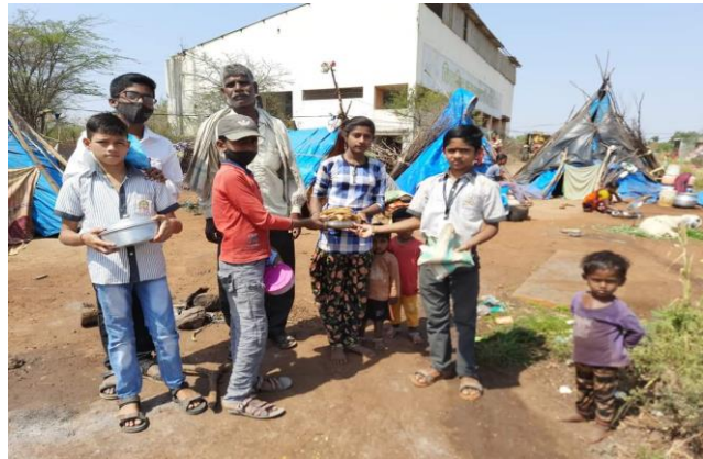
Poli dan Activity by Students