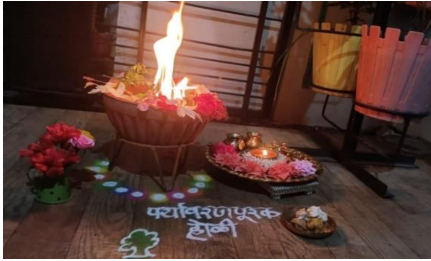
Ecofriendly holi celebration by students