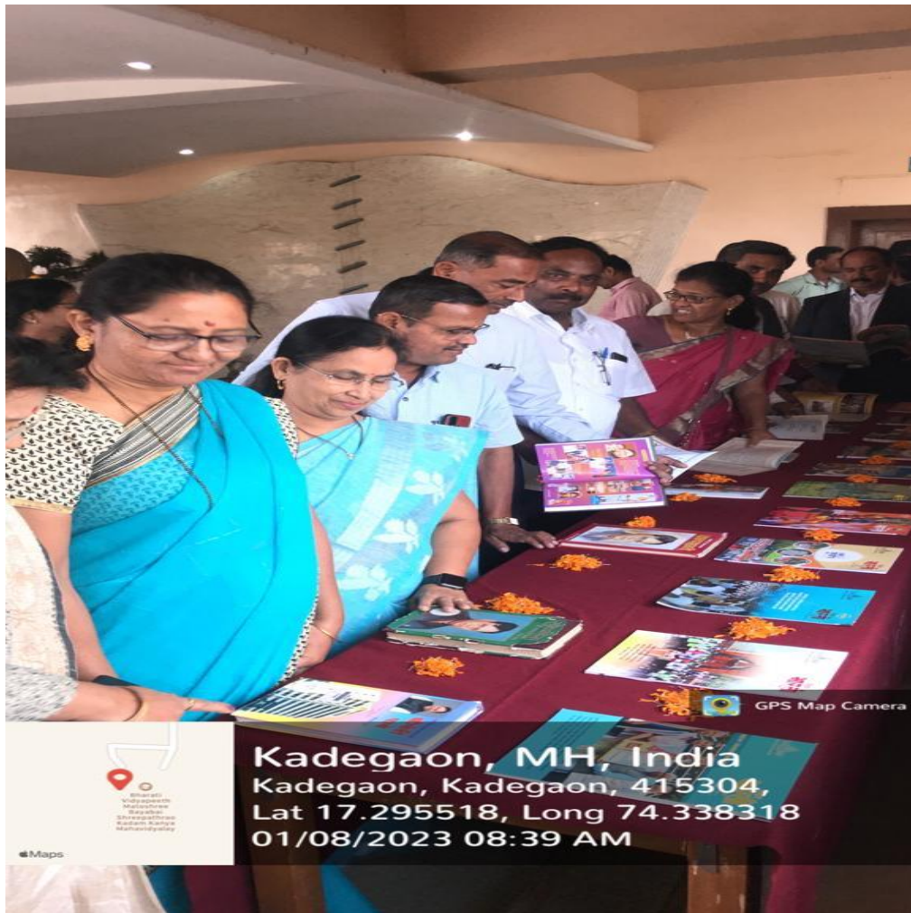
Dr.Patangrao Kadam (8 January 1944 – 9 March 2018) was an Indian politician from the state of Maharashtra. He came from a middle level farmer family in a small village, Sonsal in Sangli