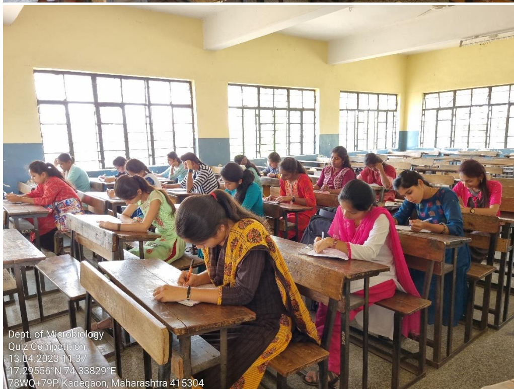
Dept. of Microbiology Quiz Competition 13.04.2023 11:37 17.29556°N 74.33829°E 78WQ+79P, Kadegaon, Maharashtra 415304