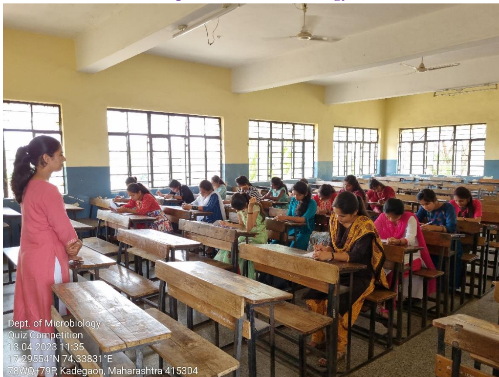
Dept. of Microbiology Quiz Competition 13.04.2023 11:35 17.29554°N 74.33831°E 78WQ+79P, Kadegaon, Maharashtra 415304