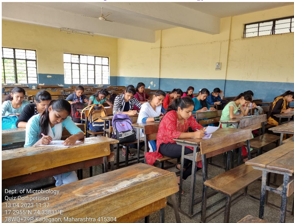
Dept. of Microbiology Quiz Competition 13.04.2023 11:37 17.2955°N 74.33831°E 78WQ+79P, Kadegaon, Maharashtra 415304