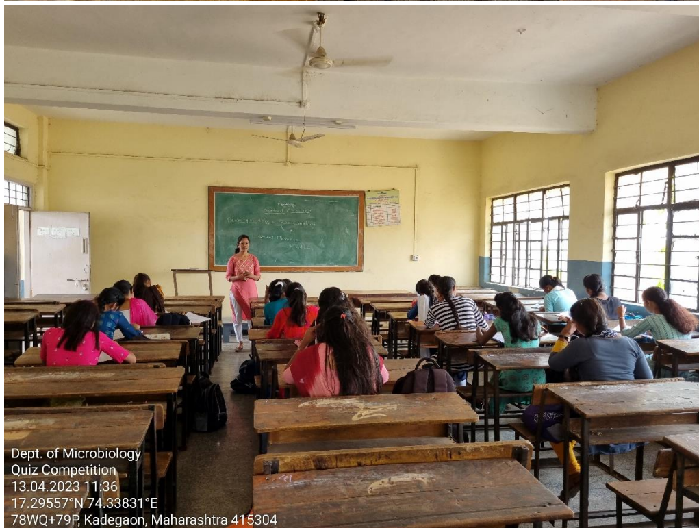
Dept. of Microbiology Quiz Competition 13.04.2023 11:36 17.29557°N 74.33831°E 78WQ+79P, Kadegaon, Maharashtra 415304