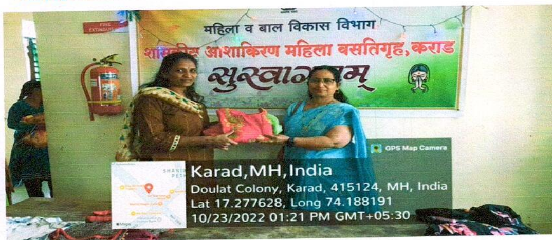
She likes a dress ...