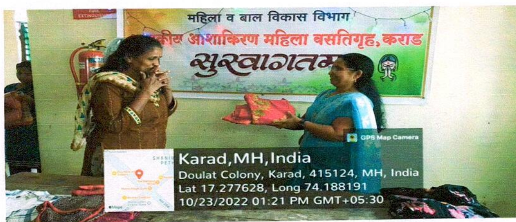
A happy Moment in her life ...