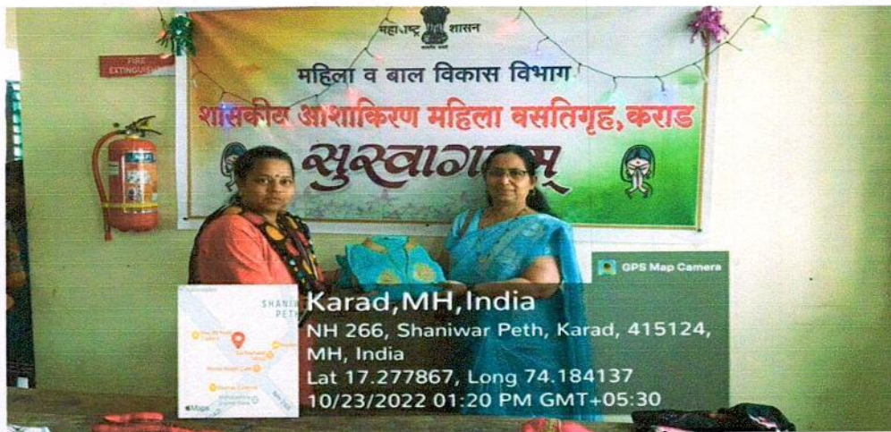
Diwali Gift ....