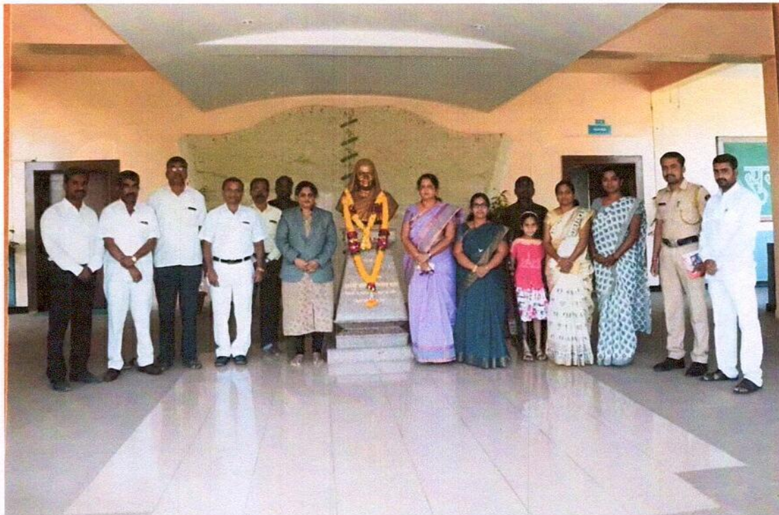
Pratima Poojan of Hon. Matoshri Bayabai Shripatrao Kadam by all the dignitaries, Civil Court Kadegaon ...