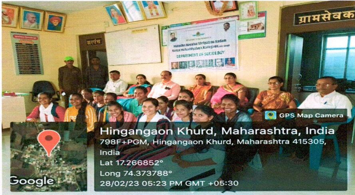
In the Gram Panchayat office ...