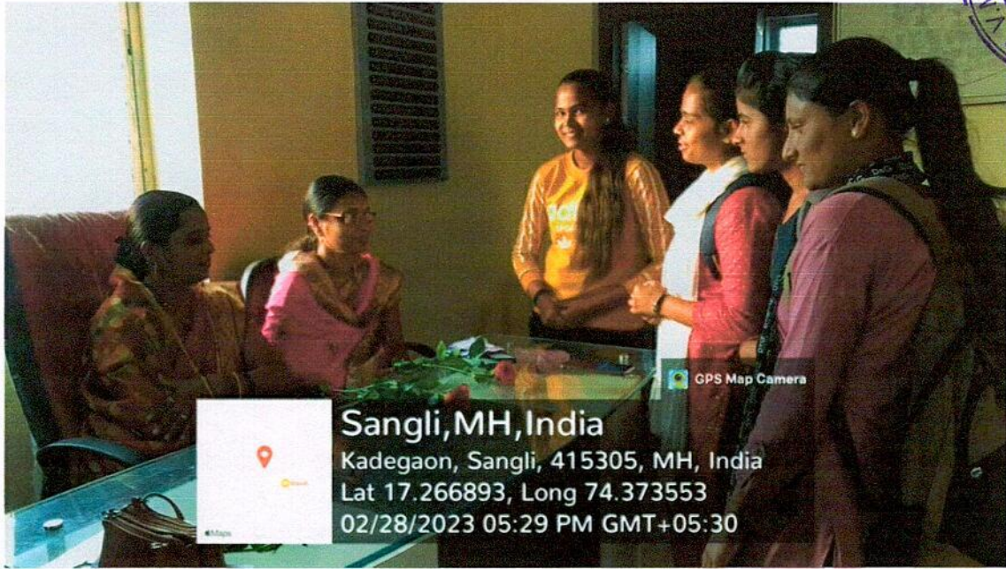
Students asking some questions and doubts regarding gram Panchayat